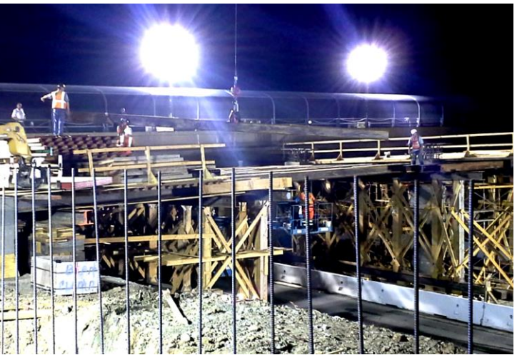
Setting girders for bridge extension over SR 20/49 during night work

Stage II work in 2014 will include widening of the northern portion of the bridge over the freeway and construction of the northern side of Dorsey Drive. Other work in Stage II will be to construct Joerschke Drive improvements, place medians on Dorsey Drive, and place final asphalt on the freeway and Dorsey Drive. The planned completion of the interchange is fall of 2014.