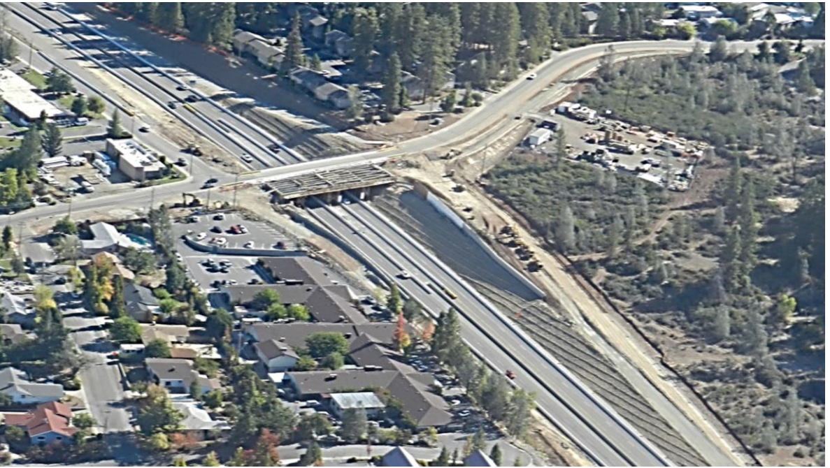
Dorsey Drive Interchange construction site with exit and entrance ramps and bridge widening under construction

Dorsey Drive Interchange Project in Grass Valley got off to a great start this summer with a lot of earth moved and ramps formed for the southbound and northbound on and off ramps. The Dorsey Drive bridge that carries traffic across the freeway was widened on the south side and widening work was done along Dorsey Drive on the south side of the roadway.